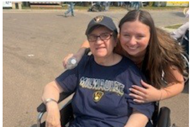
WI VALLEY FAIR